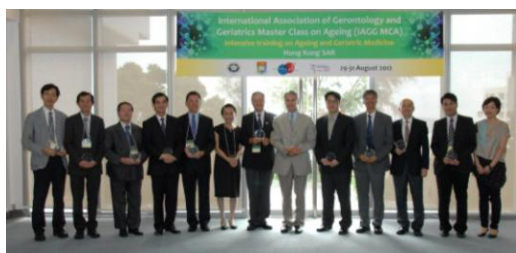
Master Class tutors

So, on behalf of the IAGG, we would like to express our warmest thanks to the Organizers and invited speakers for their wonderful participation. Our Organization greatly appreciated all the hard work undergone to make this Course a high-level educational event. May this success be a milestone for future development and promotion Geriatric research in Asia. In view of the general enthusiasm, IAGG’s 3 rd Master Class on Ageing will take place in 2013 . More information will be available soon.