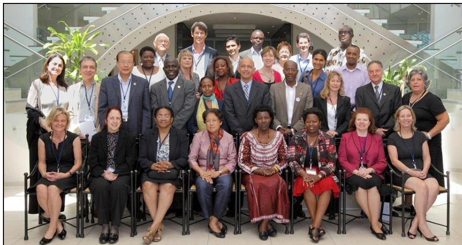
Workshop speakers and observers on October 17th, 2012

IAGG will disseminate the outcomes of the workshop as soon as possible. In the meantime, you can read the program and list of participants on IAGG's website at: http://www.iagg.info/news