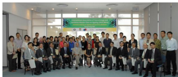
Master Class tutors & participants