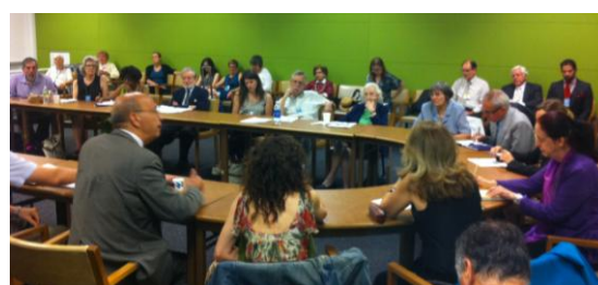
Participants at the Open Ended Working Group on Aging during a morning briefing on August 22, 2012

Conclusion: We still have a long way to go till the approval of an international instrument such as a Convention on the Rights of Older Persons but Civil Society has a fundamental role to play. Press and advocacy for the continuity of the discussing process, the feasibility of an international instrument to protect the rights of older persons until the adoption of a Convention for the Rights of Older Persons. Read the final report on IAGG website at: http://www.iagg.info